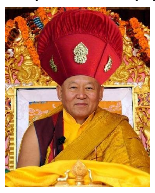
Feb. 14, 2020.