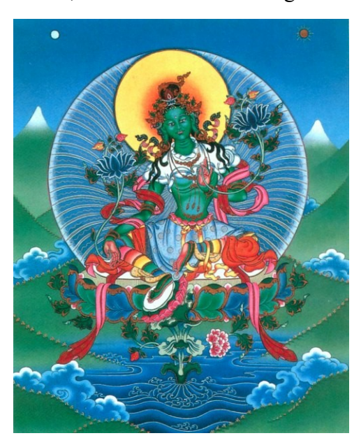
OM TARE TUTTARE TARE SVAHA

Hence, with the mantra of the goddess Tara