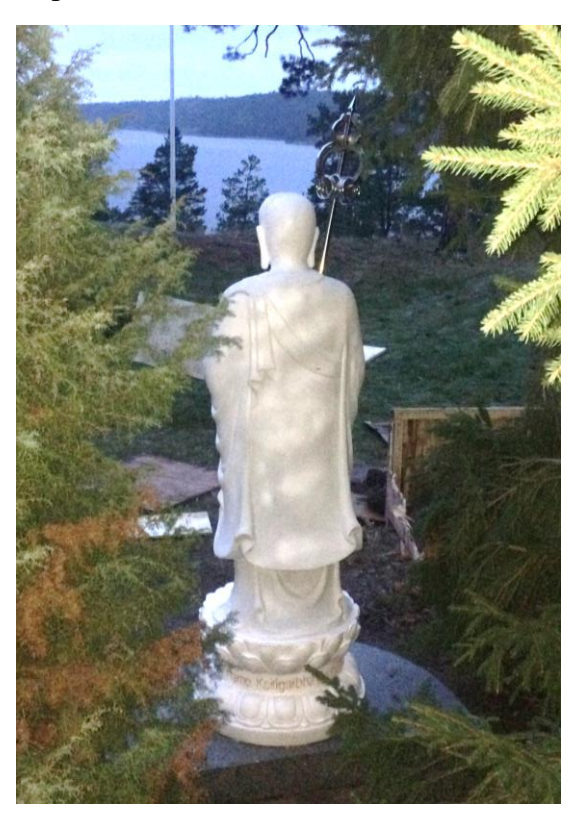
Bodhisattva Ksitigarbha statue at Ratnashri Meditation Center retreat place in Sweden overlooking the sea.