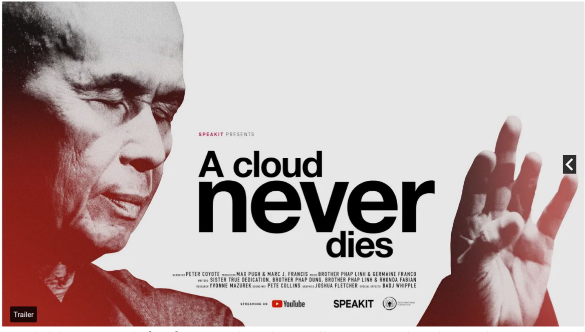
Available to watch for free on the Plum Village YouTube channel <a href="https://www.youtube.com/watch?v=DRObW9noiVk">https://www.youtube.com/watch?v=DRObW9noiVk</a>